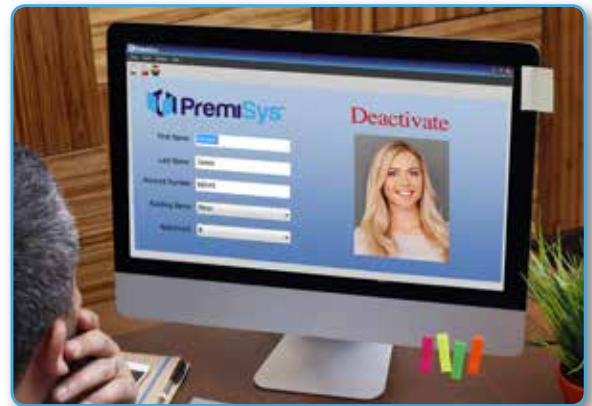
Modify tenant access with a single keystroke!