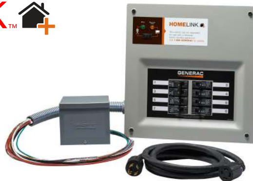
30 AMP Pre-wired Switch Kit Model 6853