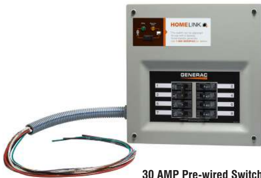
30 AMP Pre-wired Switch Model 6852