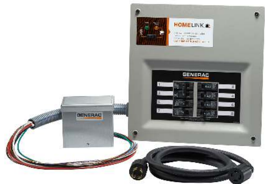
30 AMP Pre-wired Switch Kit Model 6854