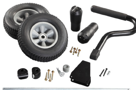
Includes all-terrain, never-flat wheels and fold-down, locking handle.